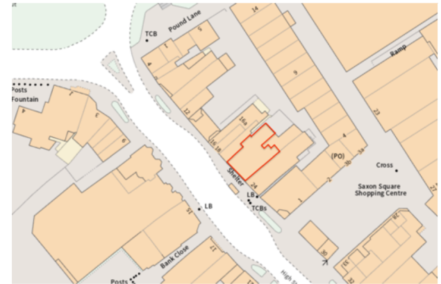
NB. The plan is for identification only.