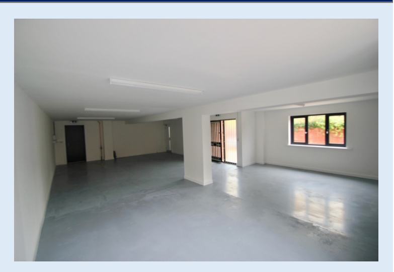
Unit 4a - Ground Floor