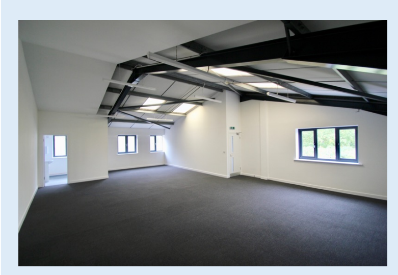
Unit 4a – First Floor

12a Hart Street Henley-on-Thames Oxfordshire RG9 2AU